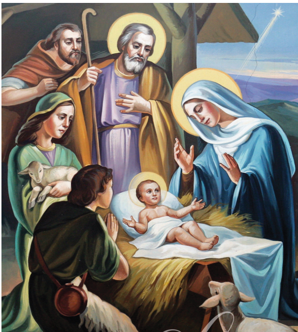
The Nativity of the Lord

SACRED HEART CEMETERY 1096 MILLSTONE RIVER RD. HILLSBOROUGH TOWNSHIP