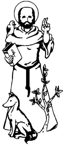
St. Francis of Assisi

Those who are kind to the poor will be happy! Proverbs 14:21