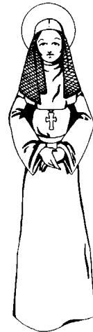
St. Elizabeth Ann Seton