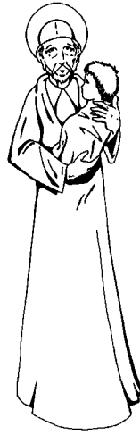
St. Nicholas of Myra