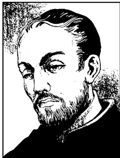
St. Alphonsus Liguori