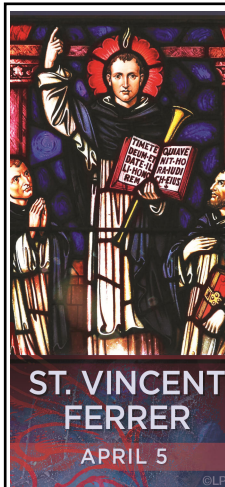
ST. VINCENT FERRER APRIL 5

We are in need of donations of butter. If you would like to donate butter for the lambs, please drop it off at the parish office.