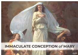
IMMACULATE CONCEPTION OF MARY

THE PARISH OFFICE WILL BE CLOSED ON TUESDAY DUE TO THE HOLYDAY. IN CASE OF AN EMERGENCY, PLEASE CALL 725-0072. PLEASE NOTE THE MASS SCHEDULE FOR THE HOLYDAY OF OBLIGATION.